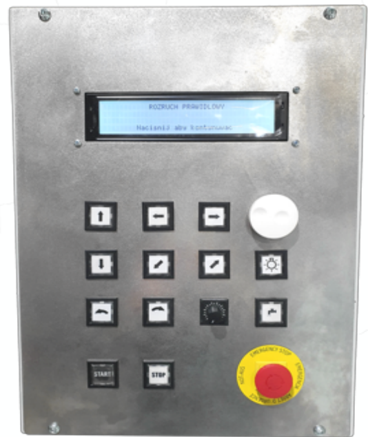
Control panel easy to operate