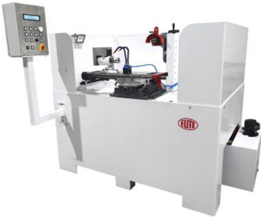
Half cabin with control panel available as optional equipment.