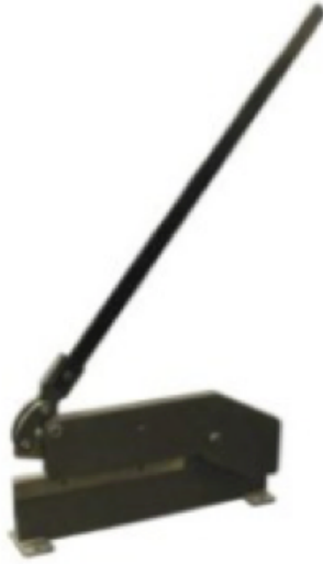
Cutting shear available as an option