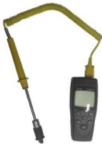
Digital thermometer available as an option